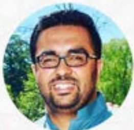
Abdullah Shafi Qur'an Academy & Youth